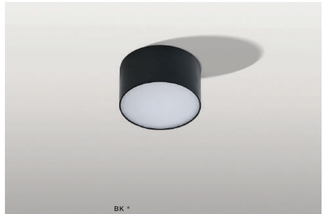
MONZA R 12 3000K/ 4000K