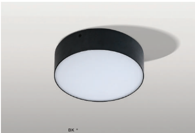
MONZA R 22 3000K/ 4000K