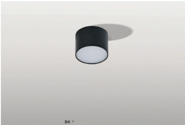
MONZA R 8 3000K/ 4000K