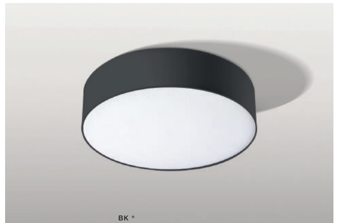
MONZA R 40 3000K/ 4000K